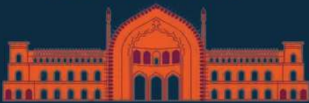
Cuisine & Lifestyle